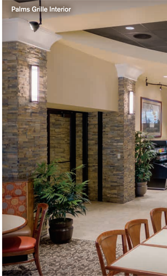
Palms Grille Interior