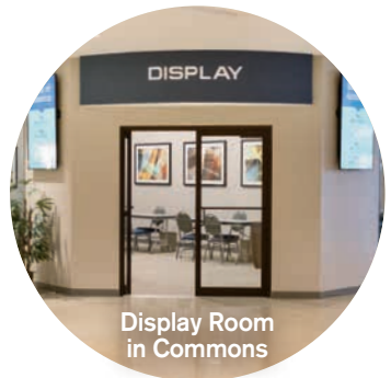
Display Room in Commons