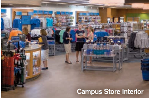
Campus Store Interior

Palms Grille offers booth and table seating options in a warm setting.