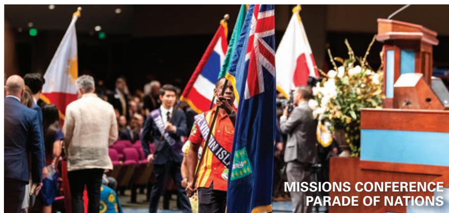
MISSIONS CONFERENCE PARADE OF NATIONS

Students must complete a broad field. Special policies are required of students who choose a broad field of Elementary Education or Teaching English (pp. 77–78).