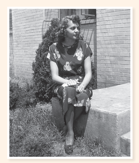
Outside her college dorm, c. 1948