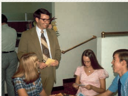
▼ Dean of Students 1975