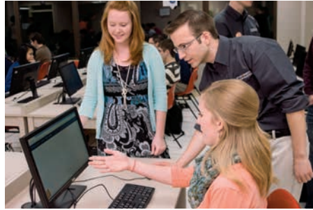
▲ The annual Software Expo showcases students' original software programs.

Graduates have entered a variety of computer fields, with alumni currently working in software engineering, project management, mobile application development, medical informatics, computer programming, database administration, game development, the military, and education. They are moving software forward at leading-edge companies like Apple, Intuit, Lockheed-Martin, and Microsoft. ■