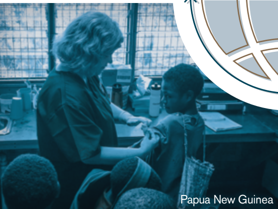
Papua New Guinea