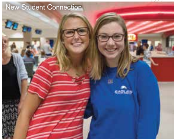
New Student Connection

And just like that, the journey through the first week of college has ended! ■