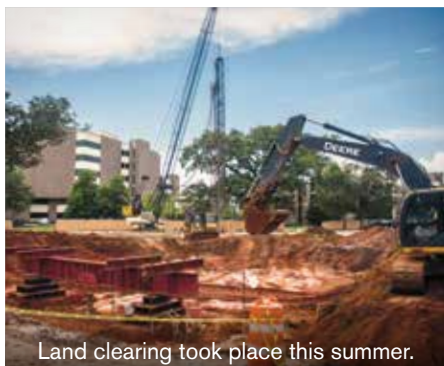
Land clearing took place this summer.