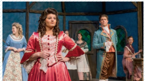
The Scarlet Pimpernel

To see how this Fine Arts Series production developed from script to performance, visit pcci.edu/PagetoStage .