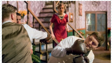
The Happiest Millionaire