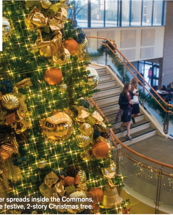
Holiday cheer spreads inside the Commons, thanks to the festive, 2-story Christmas tree.