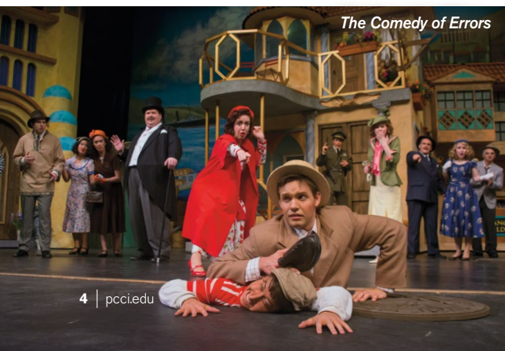
The Comedy of Errors