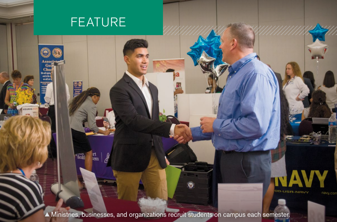
▲ Ministries, businesses, and organizations recruit students on campus each semester.