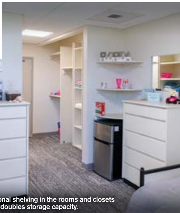
Additional shelving in the rooms and closets nearly doubles storage capacity.