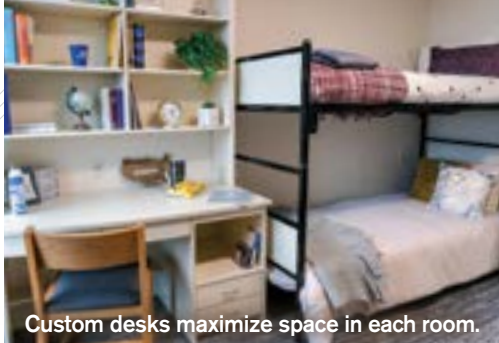
Custom desks maximize space in each room.