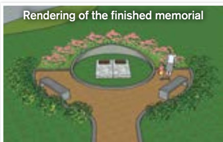
Rendering of the finished memorial