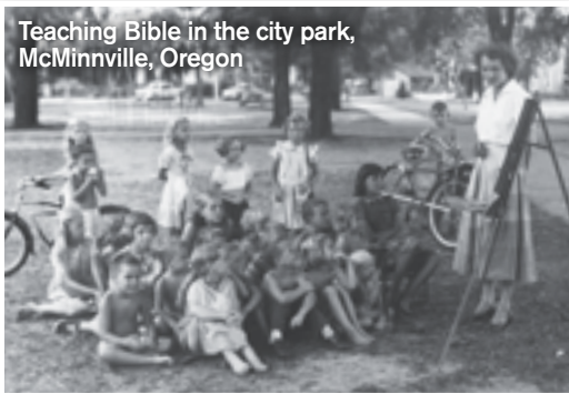
Teaching Bible in the city park, McMinnville, Oregon