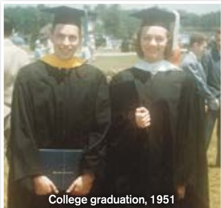
College graduation, 1951